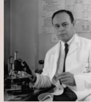
Dr. Charles Drew

Dr. Charles Drew , an African American Physician, became one of the most important scientists in the 20th Century! Dr. Drew invented blood preservation techniques which then led to the American Red Cross adopting his procedures and creating the nations blood banking process.